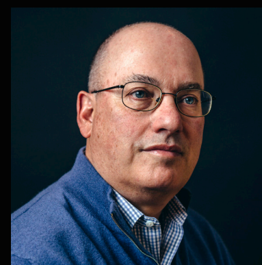
Steve Cohen American Investor & Hedge Fund Manager