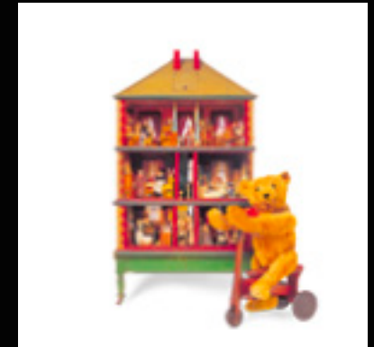
Spielzeug Welten Museum Basel