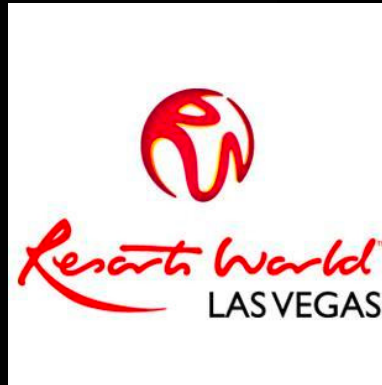
Resorts World Las Vegas